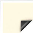
HD Progressive 1.3