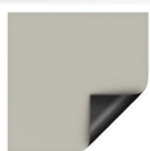
HD Progressive 0.6

The chemistry behind a HD Progressive surface is formulated to create a surface free of microscopic variances allowing the screen to essentially disappear. The result is brilliant light, vibrant color and the best surface for HD, 4K and Ultra HD projection . Choose the HD Progressive Surface that is best for your environment by using the scale below.