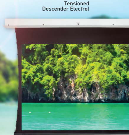
Tensioned Descender Electrol

Every projected image will look better on an HD Progressive surface.