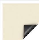
HD Progressive 1.1