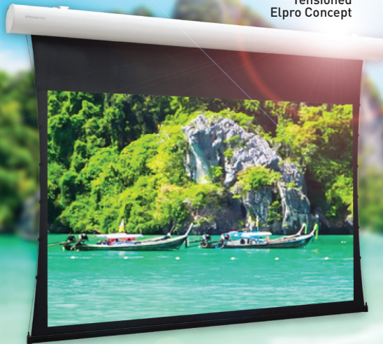
Tensioned Elpro Concept