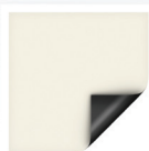
HD Progressive 0.9