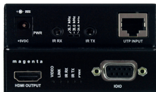
HD-ONE LX TRANSMITTER (L) AND RECEIVER (R) FRONT/BACK VIEW