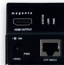
HD-ONE DX500 TRANSMITTER (L) AND RECEIVER (R) FRONT/BACK VIEW