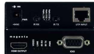
HD-ONE LX500 TRANSMITTER (L) AND RECEIVER (R) FRONT/BACK VIEW