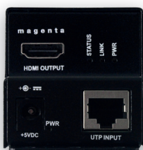
HD-ONE DX TRANSMITTER (L) AND RECEIVER (R) FRONT/BACK VIEW